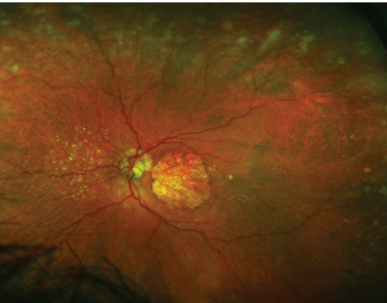
Color ultra-widefield optomap image demonstrating central-involved geographic atrophy with wide-spread peripheral changes.

The 12 year follow-up for subjects in the Reykjavik Eye Study in Iceland were evaluated with optomap color and autofluorescence imaging. Phenotyping the retinal periphery using the categories defined by the International Classification confirmed the presence of wide-ranging AMD-like pathologic changes even in those without central sight-threatening macular disease. Authors propose new, reliably identifiable grading categories that may be more suited for population-based ultra-widefield imaging.