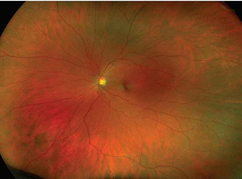
An optomap image of a healthy retina